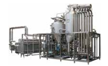
InfusionPlus™ System Groundbreaking thermal processing technology for producing commercially sterile Extended Shelf Life products with fresh milk taste