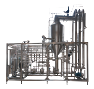
Injection UHT Direct steam injection UHT for high quality products with low chemical degradation