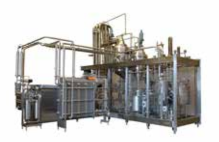
Pure-Lac™ System A creative concept of protecting fresh product taste with an extended shelf life

Gentle thermal treatment to achieve extended shelf life for the freshest tastes, and preserve nutrition while providing extended runtimes to help increase profits.